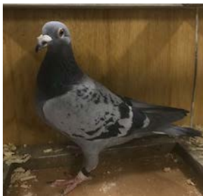
Billy Coles (FED Winners 650 miles)

The Billy Coles bloodline of pigeons are consistent FED winners from the Long Distance for G & L Azar over many years.