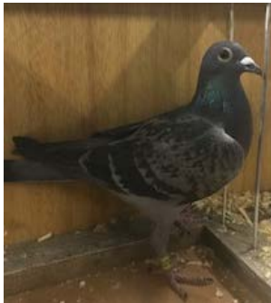
Billy Coles (FED Winners 650 miles)

The Billy Coles bloodline of pigeons are consistent FED winners from the Long Distance for G & L Azar over many years.